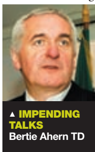
▲ IMPENDING TALKS Bertie Ahern TD