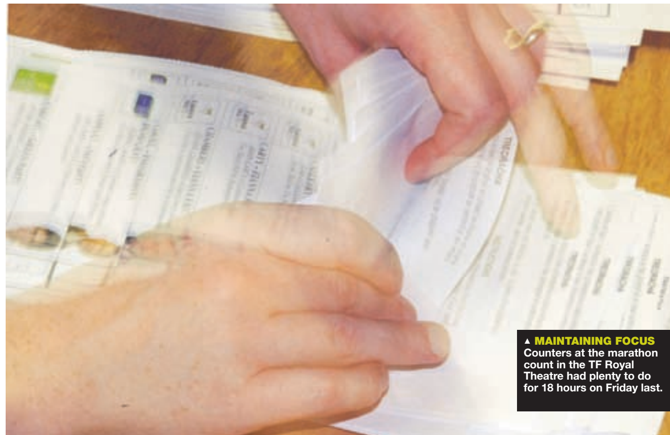
▲ MAINTAINING FOCUS Counters at the marathon count in the TF Royal Theatre had plenty to do for 18 hours on Friday last.